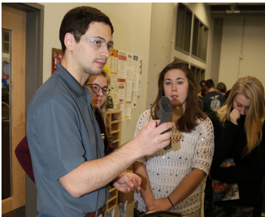
UNI Metal Casting Center Staff giving tour to area high school students.